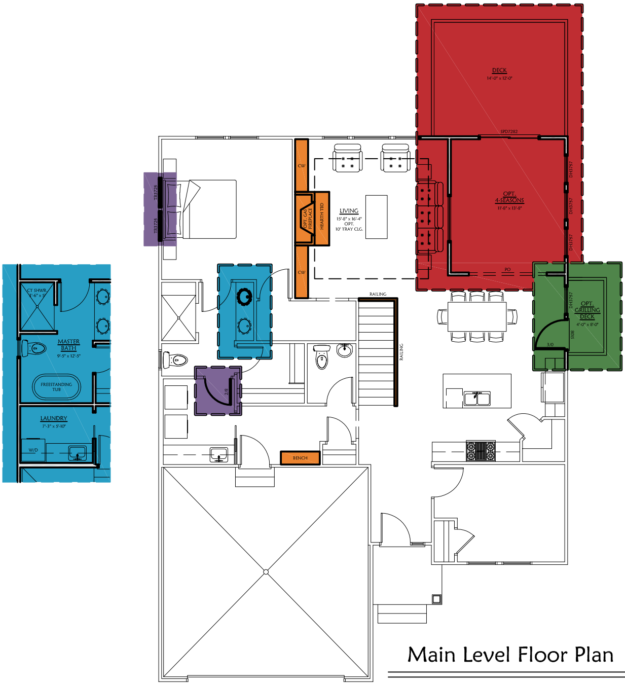
Main Level Floor Plan