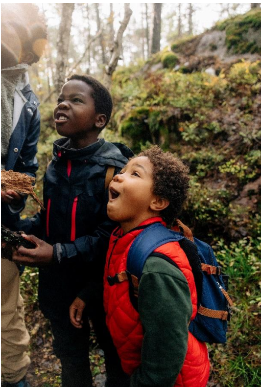
Young adventurers, unite!