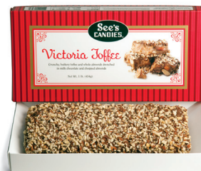
Victoria Toffee A Mary See original. 1 lb #396 Discount Price $16.30 ea. Retail Price $20.50 ea. Save $4.20