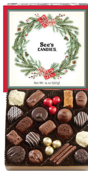
Wreath Box Deck-the-halls delicious. 14 oz #9674 Discount Price $21.25 ea. Retail Price $24.50 ea. Save $3.25