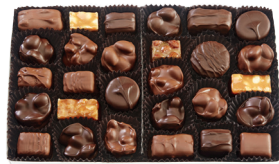
Nuts & Chews Yummy, crunchy and chewy. Delivered in seasonal wrap.

1 lb #318 Discount Price $16.30 ea. Retail Price $20.50 ea. Save $4.20 2 lb #319 Discount Price $32.60 ea. Retail Price $41.00 ea. Save $8.40