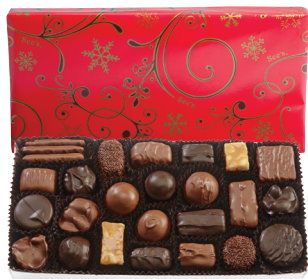
Assorted Chocolates Milk and dark decadence. Delivered in seasonal wrap.

1 lb #318 Discount Price $16.30 ea. Retail Price $20.50 ea. Save $4.20 2 lb #319 Discount Price $32.60 ea. Retail Price $41.00 ea. Save $8.40