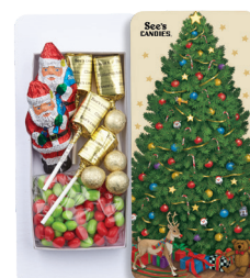
Christmas Tree Box Full of yummy holiday cheer. 7.5 oz #9548 Discount Price $6.85 ea. Retail Price $8.10 ea. Save $1.25

Nuts, caramels and more. 2 lb #348 Discount Price $43.25 ea. Retail Price $49.75 ea. Save $6.50