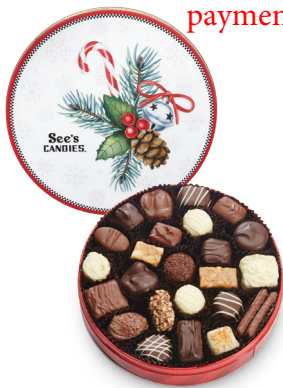
Holiday Joy Keepsake Tin Memorable and mouthwatering. 15 oz #9666 Discount Price $23.60 ea. Retail Price $27.10 ea. Save $3.50