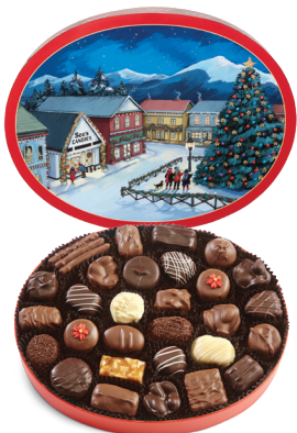
Christmas Memories Box Make a lasting impression. 1 lb 4 oz #9665 Discount Price $32.60 ea. Retail Price $37.50 ea. Save $4.90

COPMEA is having two pre-order events just in time for Thanksgiving and Christmas. The Thanksgiving deadline is November 9, 2018. The Christmas deadline is December 7, 2018. Complete the form below and submit the payment to the COPMEA Office, 251 W. Washington St., 2nd Fl.