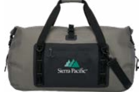
BG388 Urban Peak® Waterproof 46L Quake Dry Bag/Duffel