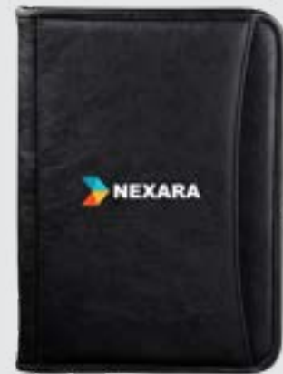
UPK59 Oxford Padfolio/GBSG Gift Set