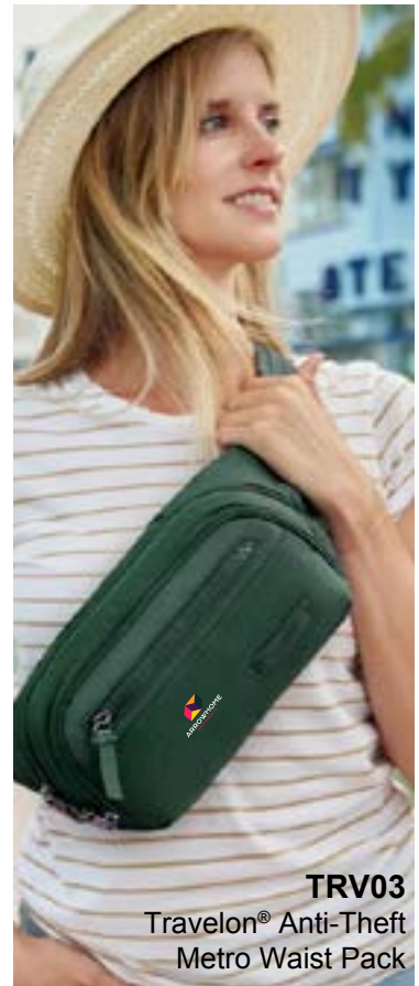
TRV03 Travelon® Anti-Theft Metro Waist Pack