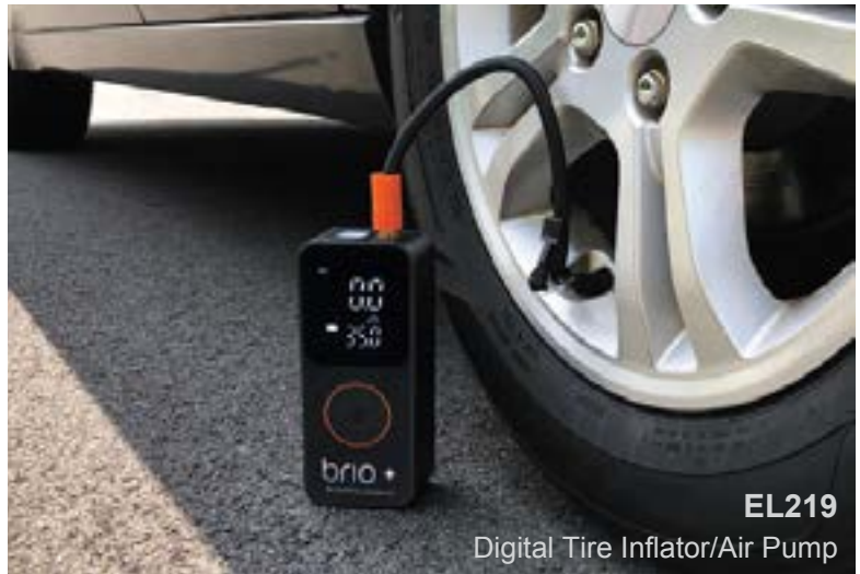
EL219 Digital Tire Inflator/Air Pump