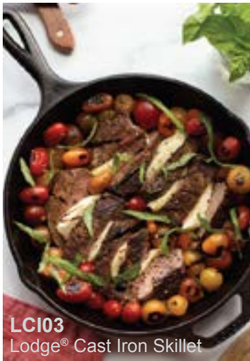
LCI03 Lodge® Cast Iron Skillet