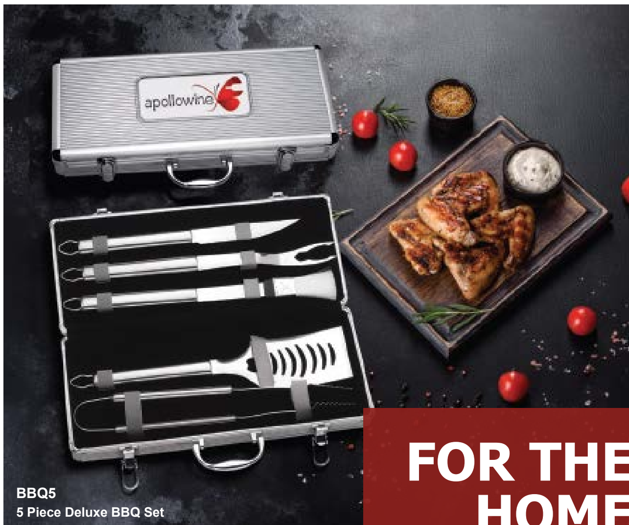
BBQ5 5 Piece Deluxe BBQ Set