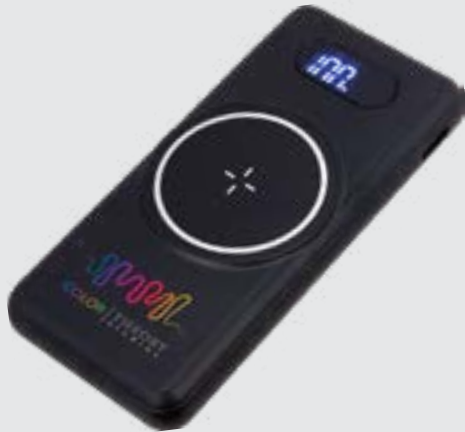
EL208 Magnetic Wireless Charger & Power Bank 10,000 mAh