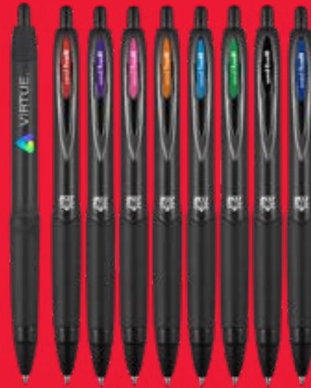
UB27 uni-ball® 207 PLUS+ Gel Pen