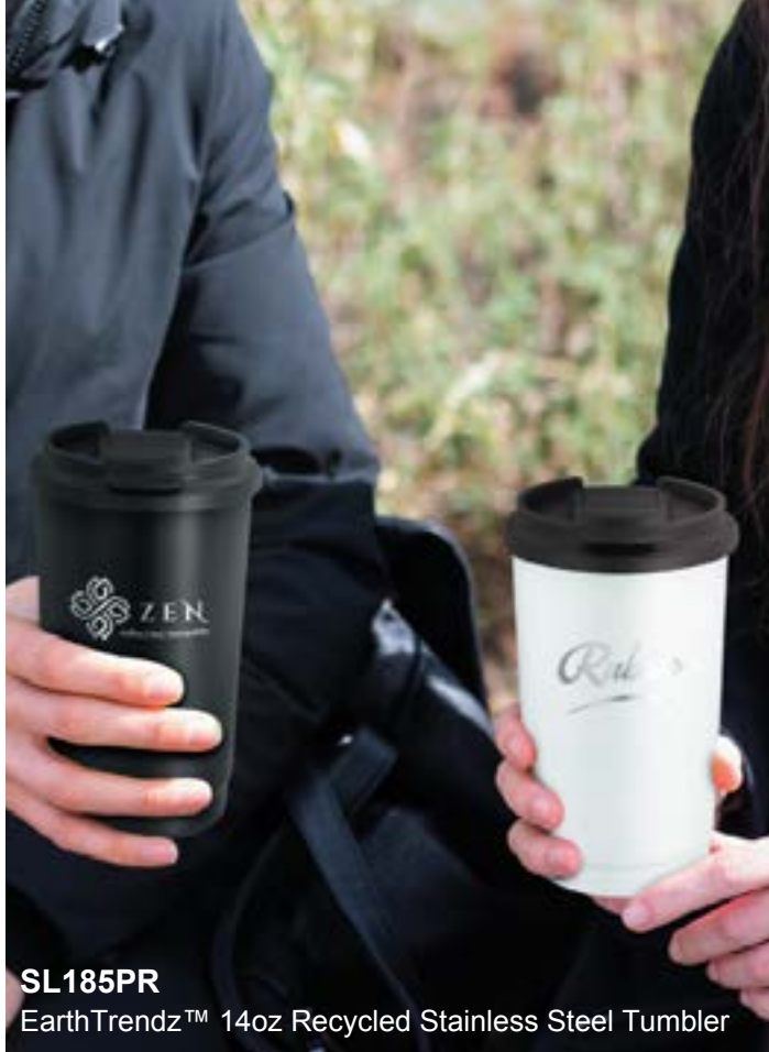
SL185PR EarthTrendz™ 14oz Recycled Stainless Steel Tumbler