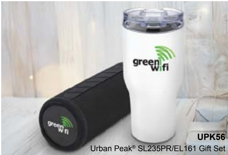
UPK56 Urban Peak® SL235PR/EL161 Gift Set