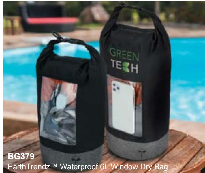
BG379 EarthTrendz™ Waterproof 6L Window Dry Bag

Sustainability continues to be a driving force in promotional product trends, with eco-friendly items gaining popularity across all industries. From reusable drinkware and tote bags to recycled pens and bamboo products, businesses are prioritizing environmentally conscious options that align with consumers' growing commitment to sustainability. These thoughtful, eco-friendly gifts not only reduce waste but also offer a powerful way to demonstrate a brand's values and commitment to a greener future.