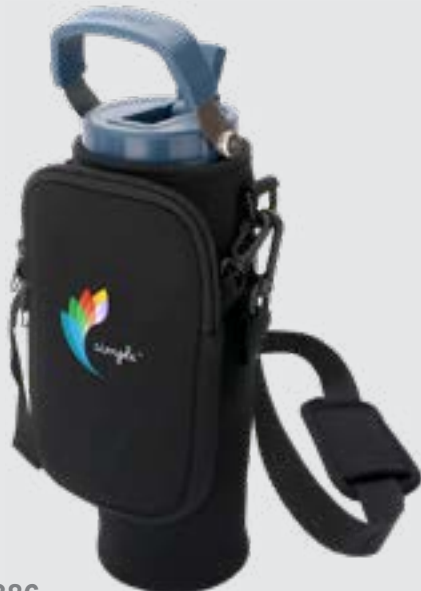
BG386 Essentials Waterbottle Holder