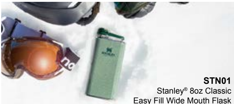
STN01 Stanley® 8oz Classic Easy Fill Wide Mouth Flask