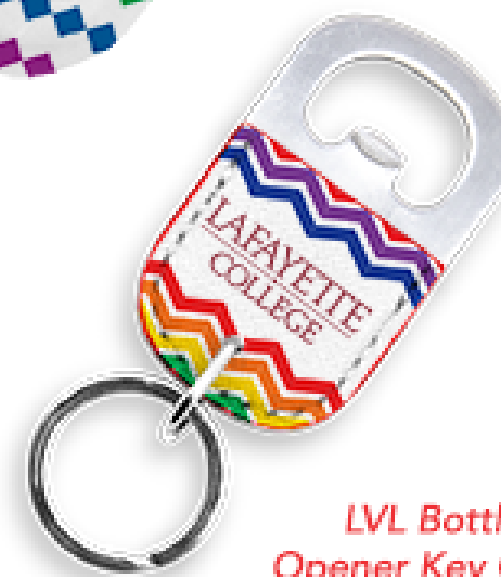
LVL Bottle Opener Key Chain