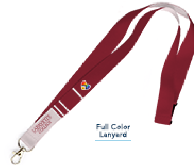
Full Color Lanyard