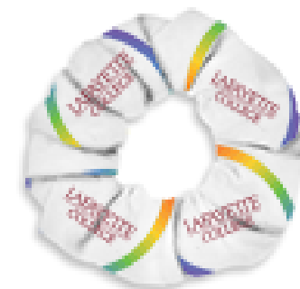
Full Color Scrunchie