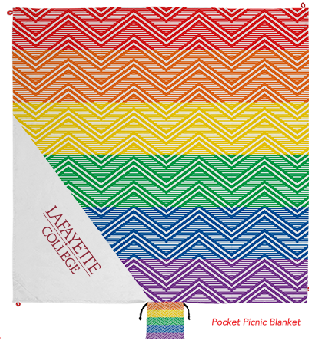
Pocket Picnic Blanket