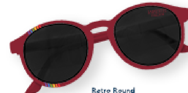
Retro Round Sunglasses