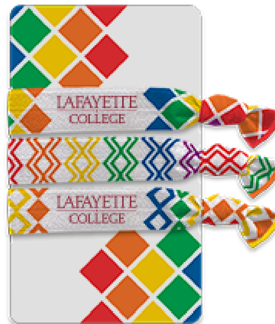
Knotted Hair Ties

Make an impression this Pride Month with our line of 100% custom full color or Pantone matched products