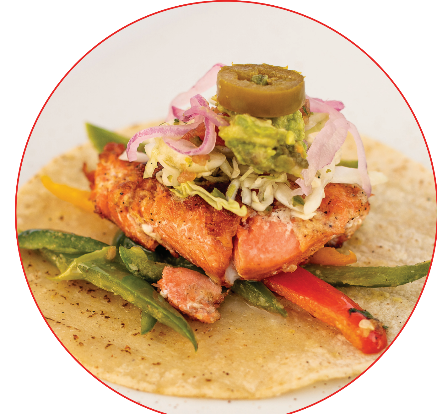
Cuban Salmon Taco

Grilled chimichurri chicken topped with all our freshly prepared toppings.