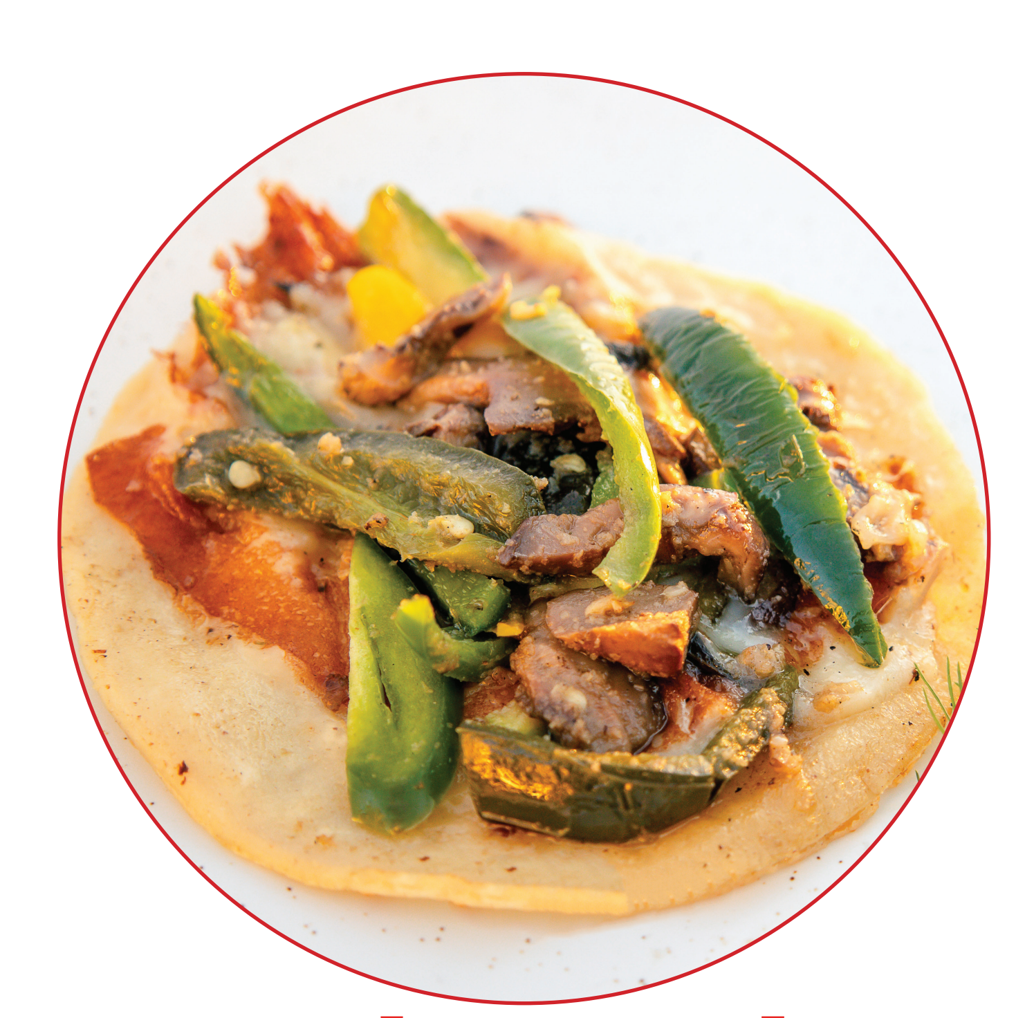
Mushroom A la Poblano Taco

Fresh avocado, house made pico de gallo, tropical black beans, and melted cheese.