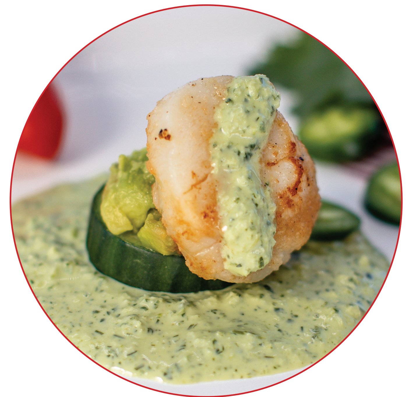
Grilled Scallop Bite

Wild caught shrimp is grilled alongside fresh jalapeños and topped with all our freshly prepared toppings and a house made smoked chili hot sauce.