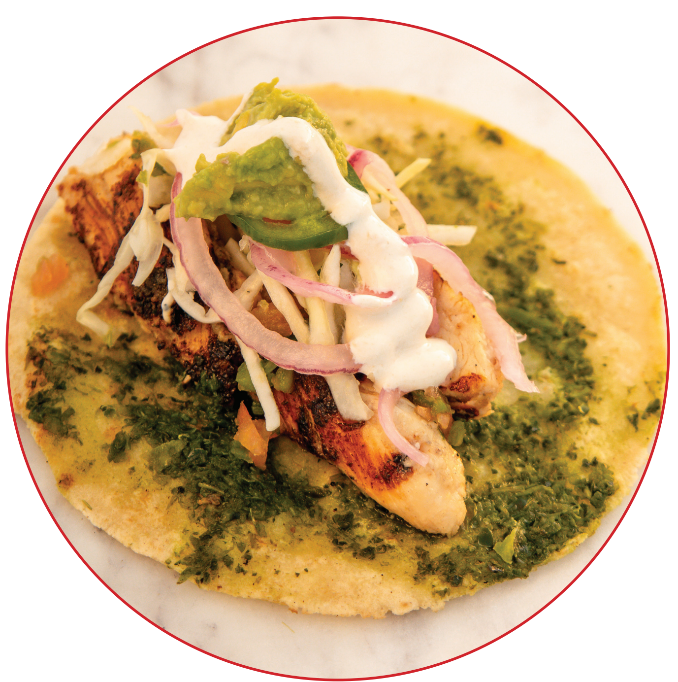
Chimichurri Chicken Taco

A bacon wrapped shrimp on top of a fresh slice of cucumber, fresh avocado, and topped with