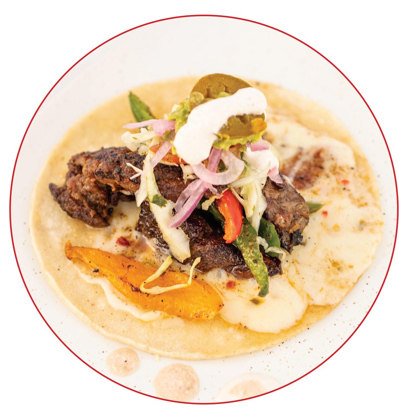
Carne Asada Taco

Our freshly prepared toppings include: House made Pico de gallo, Spanish Salad, Pickled Onions, Fresh Avocado, Pickled Mild Jalapenos, and Creme Fresh. Included as standard for all open faced tacos and burrito entrees.