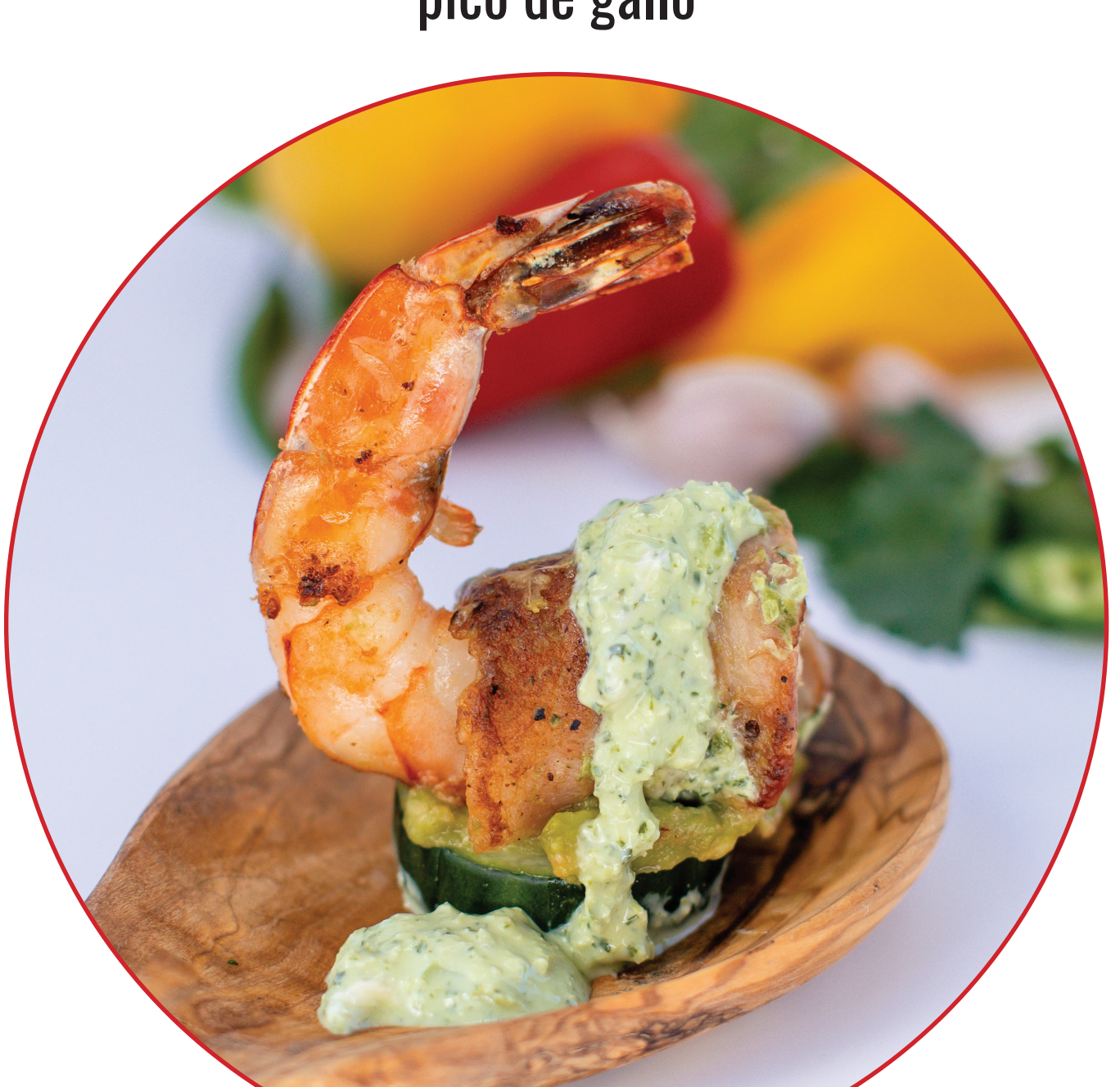
Cucumber Shrimp Bite

Fresh grilled scallop on top of a fresh cucumber slice, fresh avocado, and topped with an organic house made Raita Sauce.