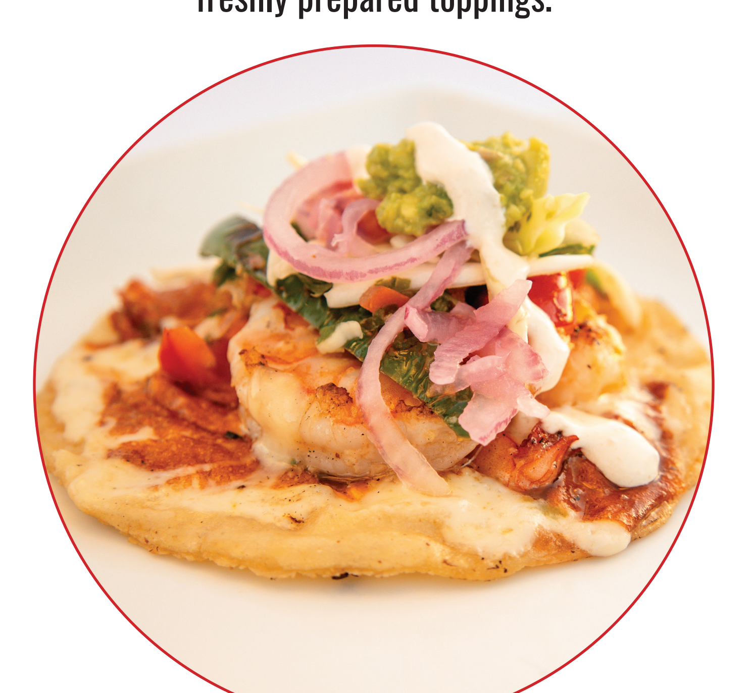
Spicy Shrimp Taco

Topped with our house made pico de gallo