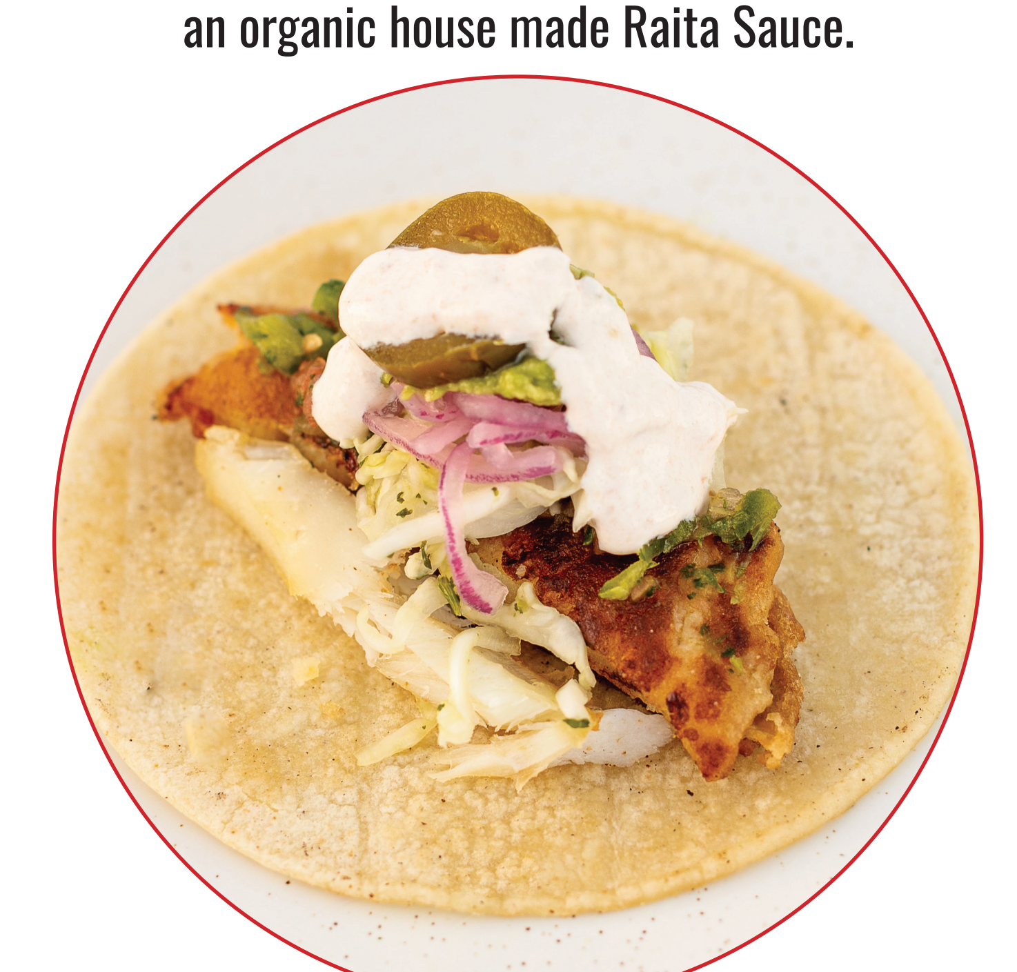
Caribbean Fish Taco

Grilled wild-caught Salmon with citrus slaw and fresh toppings in a fresh corn tortilla