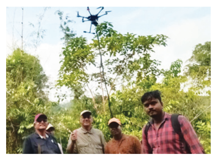
Figure 1: Exploration team using drones

At the time of exploration, drones provide an opportunity for the explorer to get an aerial view of the area to be explored for planning the exploration program in the first place (Figure 1). Drone aerial surveys allow the explorer to look ahead into the area of exploration and plan the approach to the designated targets. The ability of the drone to carry basic sensors also helps focus the exploration effort in specific areas based on the initial information collected from closer to the ground than standard aerial surveys. Drone surveys are also easier to conduct and more cost effective. Once basic exploration is completed, heavier drones carrying more sophisticated sensors for conducting aeromagnetic and other surveys can be deployed to gather more relevant information for designing the possible drilling programs. Drones may be used for a variety of tasks including mineral deposit mapping, exploration target surveying, mineral exploration through remote control (Le at al, 2020).