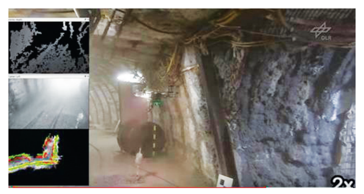
Figure 4 Autonomous Quadrotor drone flight in coal mine (after Annavarapu and Chakravarty, 2016)

distributions after blasting in underground mines (Zhang et al, 2021, Afzal et al, 2020).