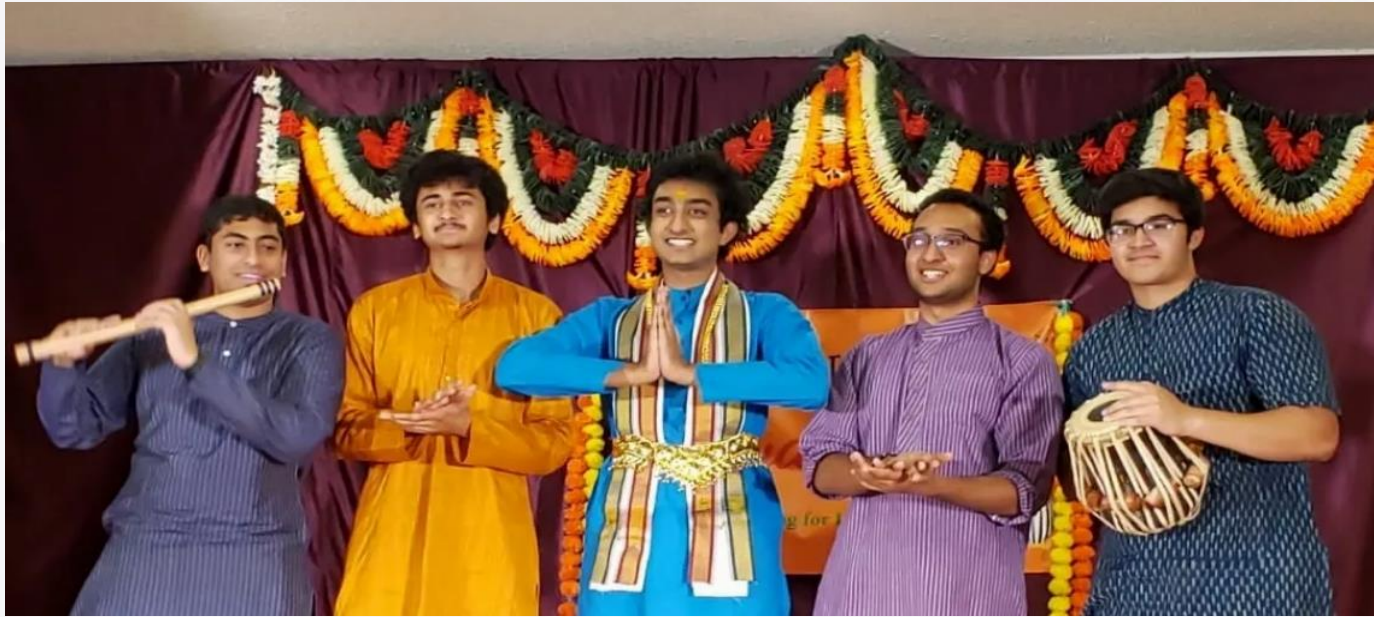
SAJAS – 5 High schoolers from Richmond, VA