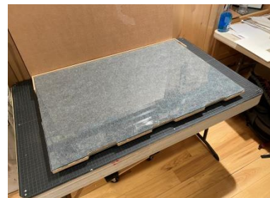
Glass down to cover paper and negative