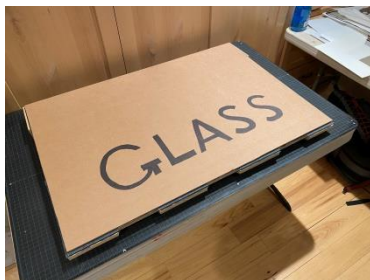
Cardboard Cover to protect Glass

I bought a piece of 3/16" crystal glass (25x37) to place on the top felt surface.