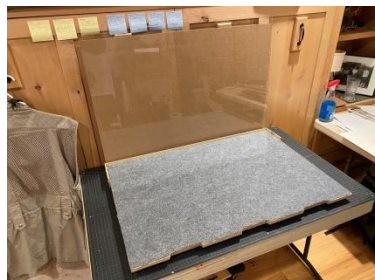
Glass tilt up for placement of paper and negative