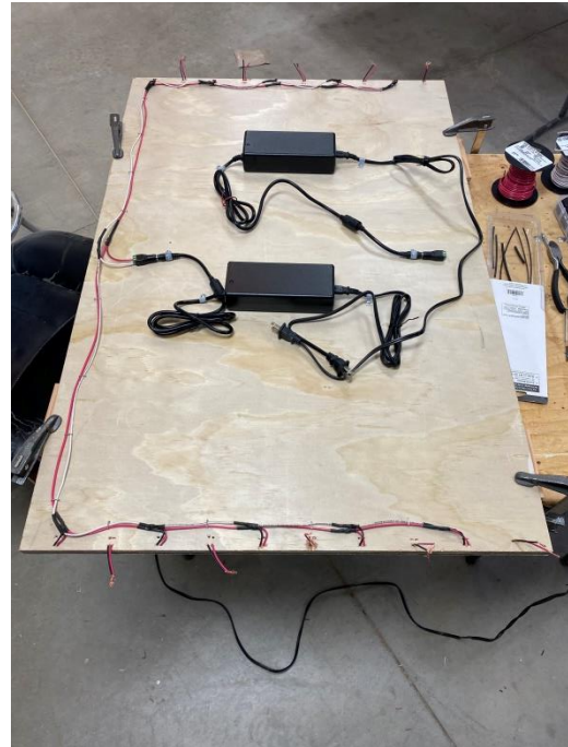
Half of the wiring complete

In my research, I read that over a 5 meter length of strip lights, there is a voltage drop. I was concerned that this aspect may provide uneven UV light. So I planned to power every other strip from one side of the panel and the remaining strips from the other. Also to hopefully reduce voltage drop, I would wire each strip in parallel. I ran this idea past both my brother and brother-in-law, both of whom have more experience in this than I do. The only suggestion to alter my plan was to connect to both ends of each strip. The wiring connections are soldered and covered with heat shrink. The wiring is stapled into place and plastic wire ties are used to anchor the transformers and barrel connectors. The two transformers will be plugged into the extension cord shown notched into the back right corner of the box on the previous page.