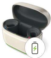
Phonak ChargerGo RIC Infinio Sphere