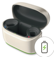
Phonak ChargerGo RIC Infinio