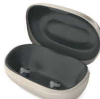
Phonak Charger Virto Infinio