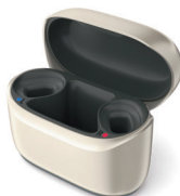
Phonak Charger RIC Infinio