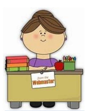
Our little webmaster when she first got the job

et me begin by saying that when I entered the room where the chapter's ⊿Board of Directors held their meetings, the last thing I ever thought about was that I would come away with a huge project like this. Let me set the stage: there were probably ten men of varying ages ready to discuss the board agenda that day. One of the New Business topics was about how the national MOAA headquarters was requesting that chapters consider establishing an internet presence. Then the question was asked, "Anyone know how to build a website?" There was a pregnant pause before one after another replied, "Not me, negative, nope, I can't find my way out of my email account, what is a website? NO!" Mind you, as an organization we were still writing checks for fees, making phone calls when we wanted information, taking Xerox copies of handwritten notes, and sending out the Newsletter by mail.