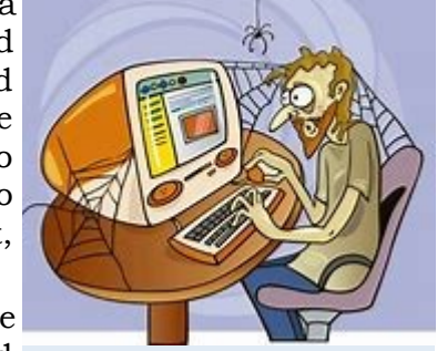
Our little webmaster after reality sunk in

In my third year as Webmaster, I was sent a notice by our website host that all the content in our website would have to be transferred over to their new (and security-improved) platform. Another three months of TUMS consumed. However, I am proud to say that from that