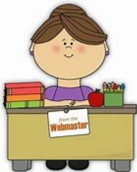
Our little webmaster when she first got the job

Let me begin by saying that when I entered the room where the chapter's Board of Directors held their meetings, the last thing I ever thought about was that I would come away with a huge project like this. Let me set the stage: there were probably ten men of varying ages ready to discuss the board agenda that day. One of the New Business topics was about how the national MOAA headquarters was requesting that chapters consider establishing an internet presence. Then the question was asked, "Anyone know how to build a website?" There was a pregnant pause before one after another replied, "Not me, negative, nope, I can't find my way out of my email account, what is a website? NO!" Mind you, as an organization we were still writing checks for fees, making phone calls when we wanted information, taking Xerox copies of handwritten notes, and sending out the Newsletter by mail.