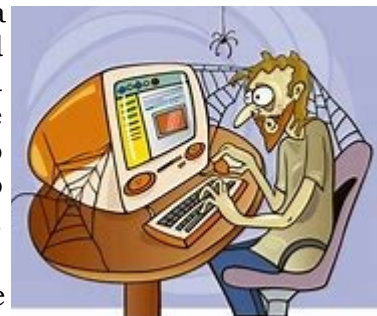
Our little webmaster after reality sunk in

I was frantic! Where do I go to even start to understand building a non-medical, military-focused, web-based internet site that was based on our chapter? Let me simply say that between the time of that board meeting in November and March of the next year, a LOT of TUMS were consumed late at night until I could send out a partial web address to the board. I must add that I brought my laptop with me in March so those on the board who were less experienced in accessing the internet, could see what I had been working on so diligently.