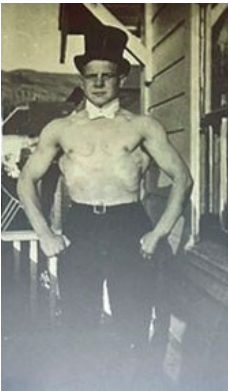
Jimmy Doolittle in his fighting days; before he took the fight to the Japanese