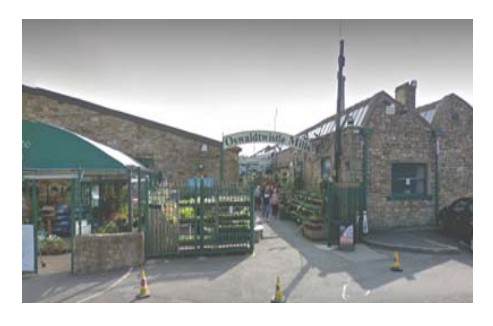
Thursday, 28<sup>th</sup> November 2019 Oswaldtwistle Shopping Village

"What a great day we've had" "Never laughed as much in ages" "When's the next one"