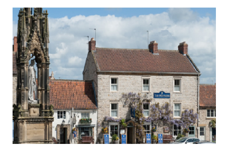
Thursday, 24<sup>th</sup> October 2019 Mermaids Fish Restaurant Morley

Recently we had trips to Millstones Harrogate, Wainstones Hotel Great Broughton and Boundary Mills Colne, which were enjoyed by all! Our future excursions are: