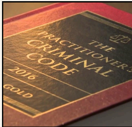
Global News, 2016

Every country establishes its own criminal code based on what it considers to be criminal behaviour. In Canada, the Criminal Code is a piece of legislation that effectively codifies most criminal law under a single, unified statute. The Parliament of Canada holds exclusive legislative authority over criminal law, as outlined in section 91(27) of the Constitution Act, 1867.