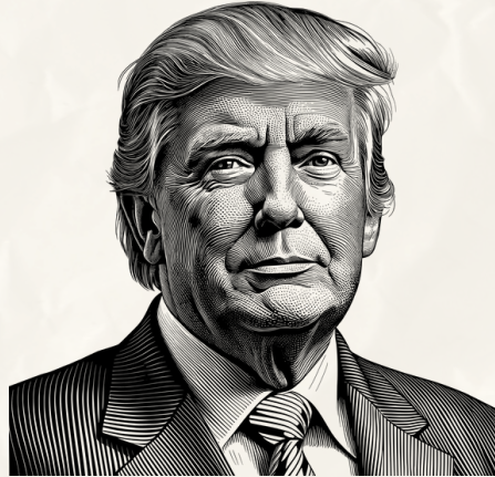
“Donald Trump.”

During Trump's inauguration speech, he made a promise to Americans that the United States would “Drill, baby, drill,” 1 referring to the exploitation of the unused oil and gas reserves that exist in America. 2 On his first day in office, Trump declared a National Energy Emergency, the first of its kind to be declared in the United States. 3 This National Energy Emergency will help stakeholders extract gas and oil resources, worsening the climate crisis. 4 The National Energy Emergency will jeopardize global climate work and increase the amount of fossil fuels released, which will exacerbate the impacts of climate change across the world.