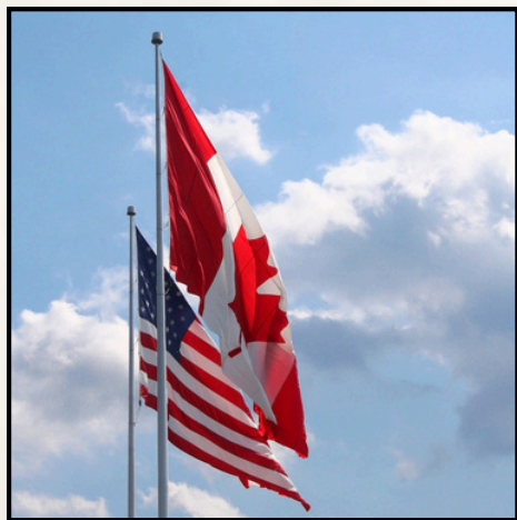
“US-Canada Flag.”

The Canada–US trade dispute is upending economic relations, with billions of dollars in tariffs changing the way we do business. In response to US tariffs on Canadian imports, Ottawa hit back with a 25% tariff on several American goods worth about $30 billion. 38 These countermeasures are backed by the Customs Tariff Act and the Export and Import Permits Act to pressure the US while keeping Canada in line with trade agreements like CUSMA and WTO rules. 39 These economic and legal responses mark a critical moment for Canadians, demanding awareness, engagement, and adaptability from policymakers and citizens alike. However, Ottawa’s tariffs are just one part of Canada’s strategy to protect its economy. Politicians are also leveraging Canada’s abundance of critical minerals in trade talks. 40 Meanwhile, the failure of Bill C-282, which sought to protect Canada’s