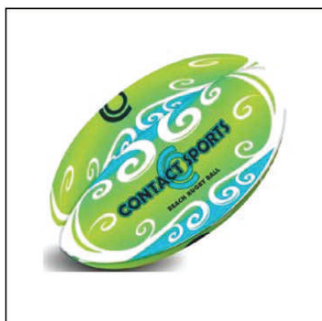
BEACH RUGBY BALL