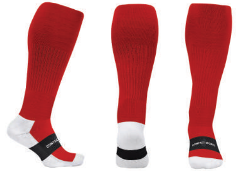
Normal Rugby Socks