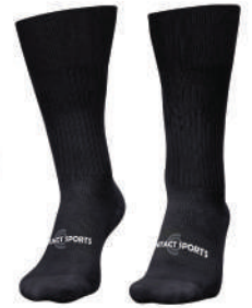
Mid Calf Socks