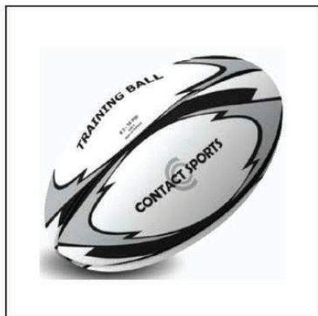
TRAINING BALLS - SIZE 5