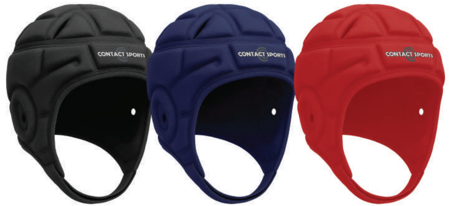
CUSTOMIZABLE SCRUM CAPS