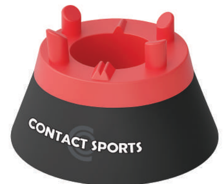
ADJUSTABLE KICKING TEE