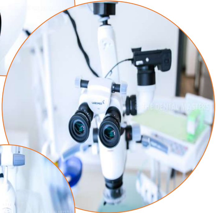
Precision Dentistry with Digital Dental Microscope