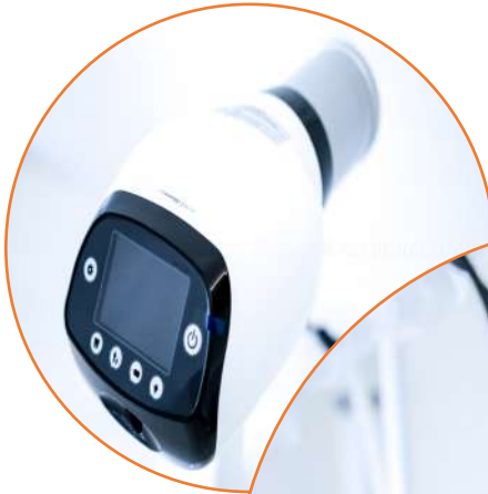
Digital X-Ray for High Resolution Images