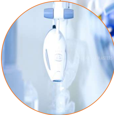
Get up to 8 Shades Brighter Smile in just 45 minutes with gold standard Philips Zoom WhiteSpeed