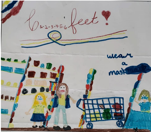
Kendall Reed, Council #7

Each year CLC holds a coloring contest for its' youngest members. The theme changes each year. This year, not only were they required to color, they were required to draw as well. What better way to spread the message to stay safe and practice everyday activities than expressing them through art? There were so many great entries. Below you will see the top three winners from each age group. The message is clear, the creativity is awesome and the coloring is incredible! Congratulations to all of the Coloring Contest winners for 2020! We love seeing your creativity and sharing it with all of our members! All of the kids that enter win a cash prize (from $1 up to $10) and the chance to win a K.I.D.S. policy from CLC until they stop entering the coloring contest or they age out. Help us congratulate all of the winners of 2020! Great job!