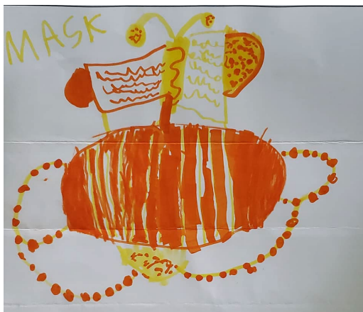
Bella Meyer, Council #179 ("Striped mask with ear straps, a chin strap with lights and a butterfly decoration on top")