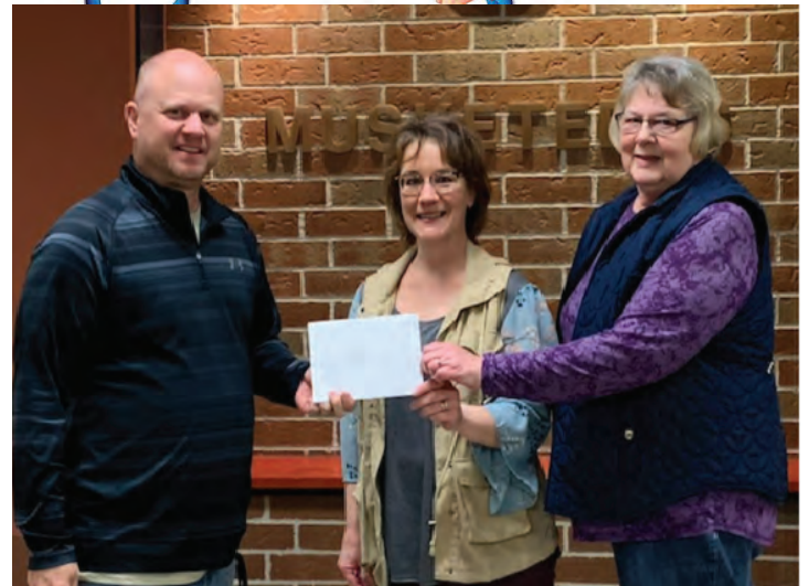
*This photo was taken previous to the stay at home orders