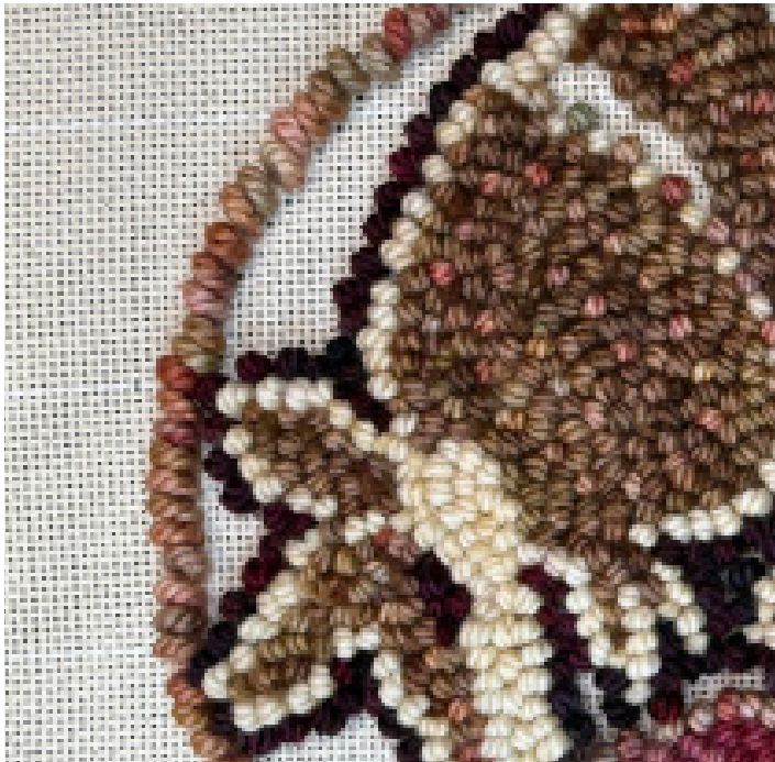
Image 3 - homework outer border

Use the #8 Regular Oxford Punch Needle to create an outer border of the trivet using the stem stitch. This is the only place we will use the #8 and this is optional if you do not have a #8. Stem stitch 6 per inch. Punch- skip one - punch.