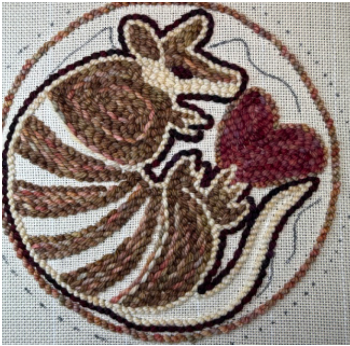
Image 1 - homework outline of armadillo

As homework you were to outline of the armadillo (dark color) with either straight stitch or stem stitch. #10 Regular.