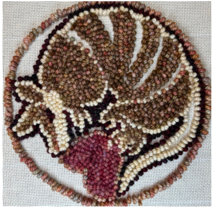
Image 2 - homework heart shape

Punch the heart with or without an outline. This is a matter of taste. You can also use another color from your stash for the heart if you want to.