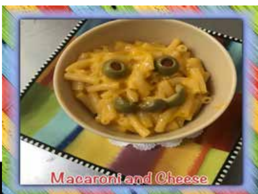
Macaroni and Cheese