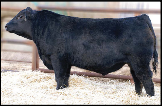
SSS Pay Dirt 357Z. Maternal grandsire to lots 17J and 99J.