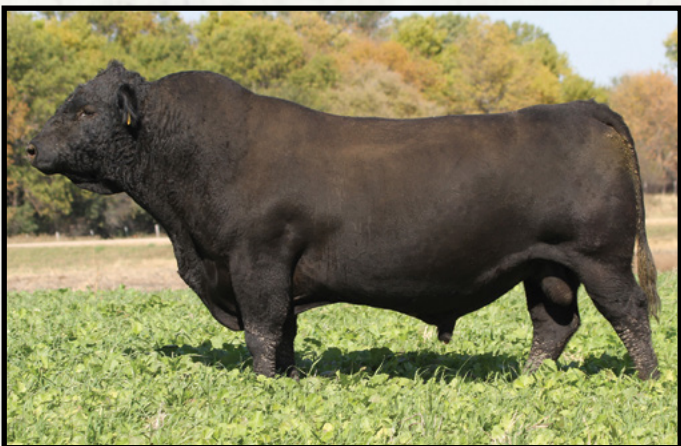
Namken Resource 33D. Maternal grandsire to lots 38J, 39J and 61J.