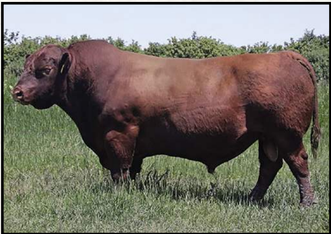
Namken Max 10A: maternal grand sire to lots 49 & 4G