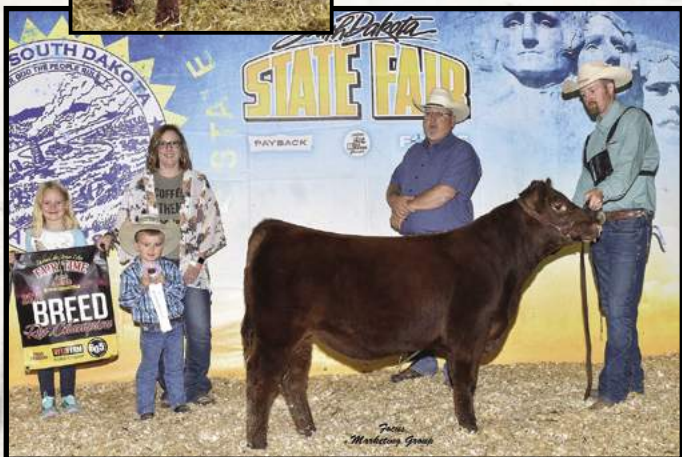
Lot 49 Reserve Champion Bull at the 2019 SD State Fair.