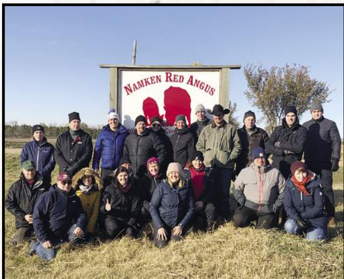
Tour group from Finland.

A black red carrier low birthweight 33D son with a 104 ADG ratio. Suitable to use on heifers.