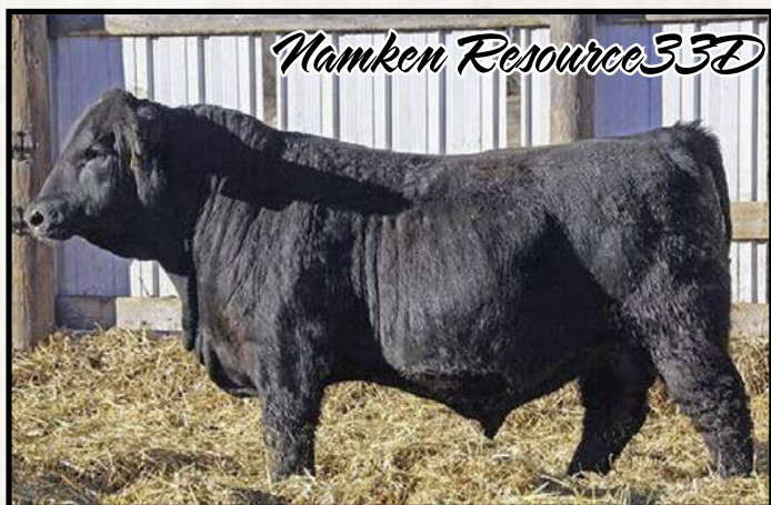
Namken Resource 33D