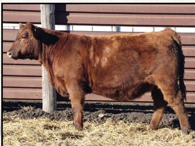
Maternal Sister to Lot 54G