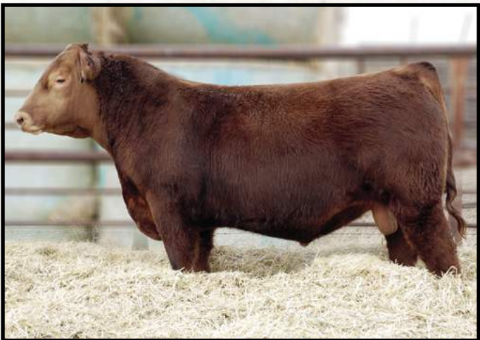
Red SSS Cooper 161B: Sire to Lots 2G, 3G, 13G