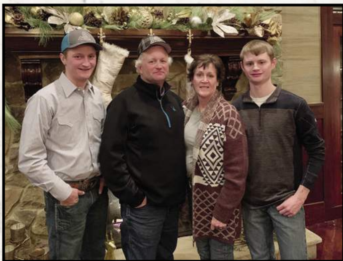
P4 Cattle Company