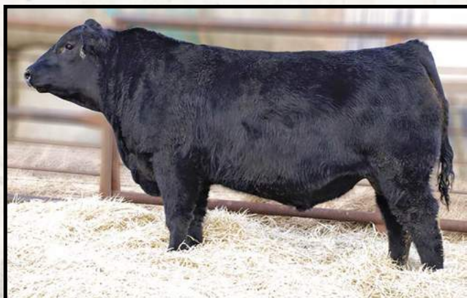
SSS Pay Dirt 357Z: Paternal Grand Sire to Lots 915 & 912, Maternal Grand Sire to Lot 14G, 54G & 88G.

A long spined, larger framed bull that will put some length on some calves.