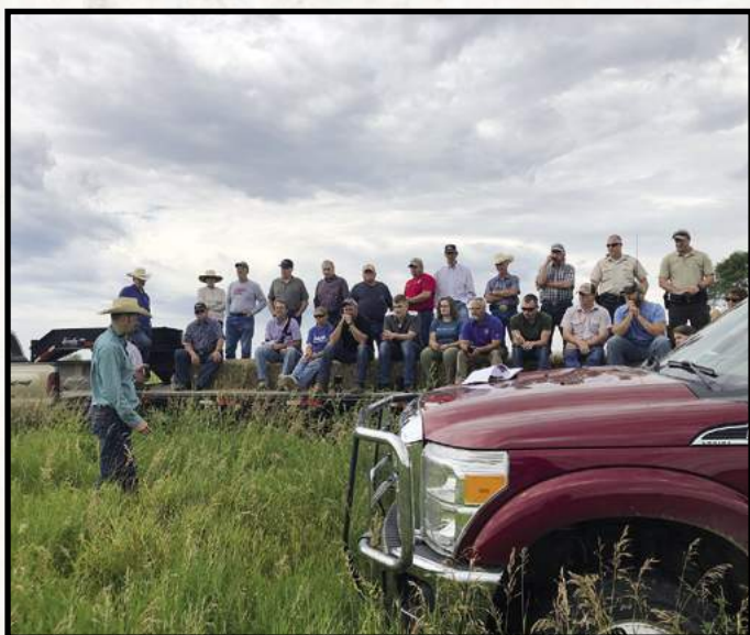
SRM Grazing Tour