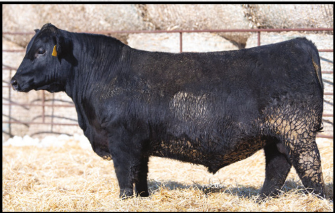
Shag Reverend 207