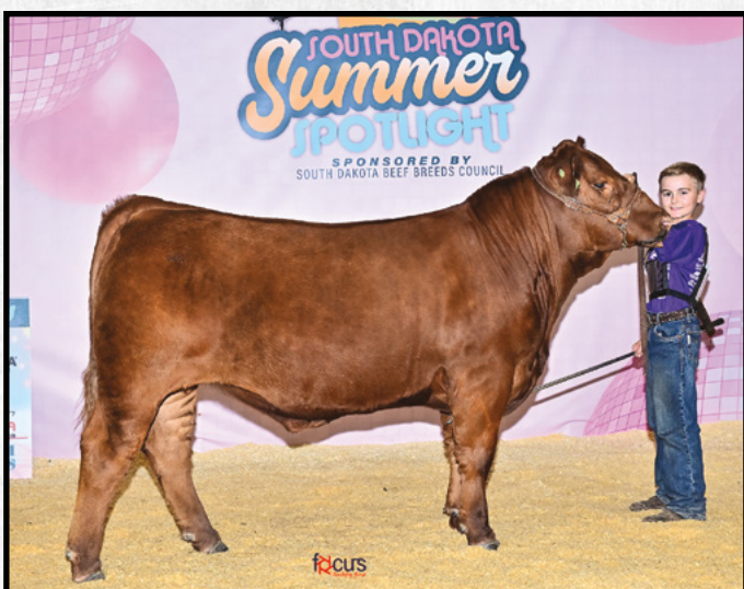
Grand Champion Red Angus Steer SD Summer Spotlight