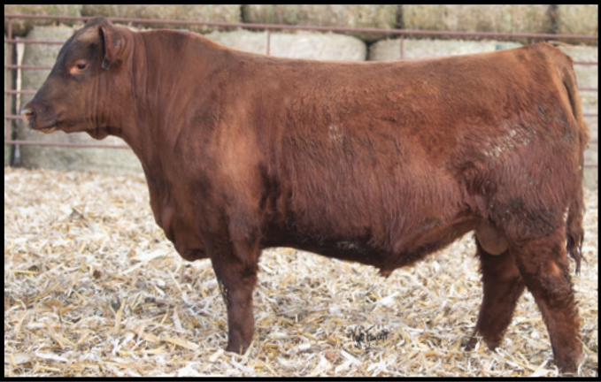
Shag Revolution 103