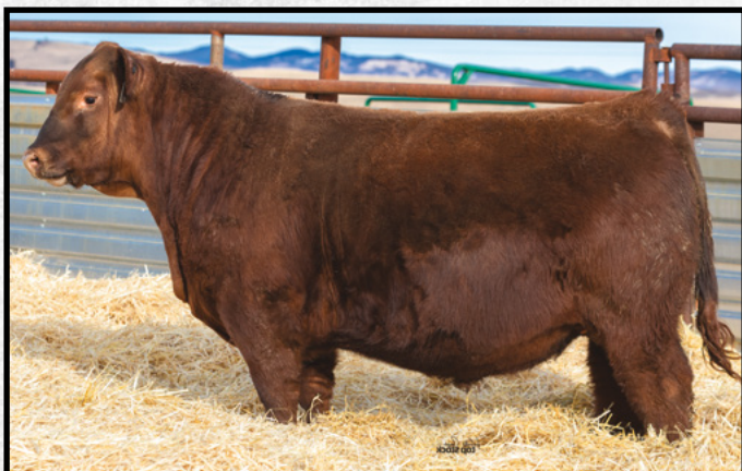
Red SSS Magellan 316J