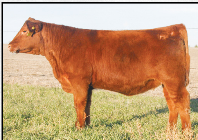
Namken Flower 77C-50L - Full Sibling to Lot 9