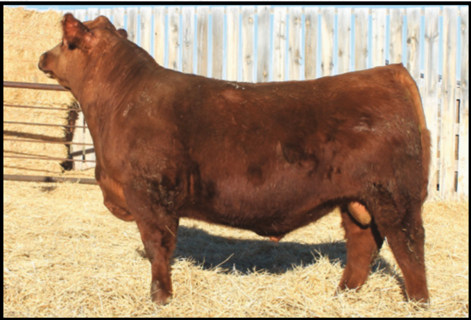
Fritz Stampede 219