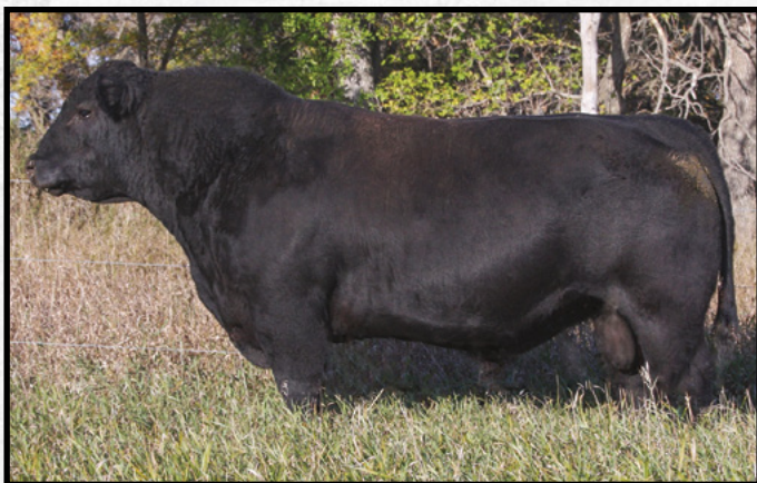
W Sunrise Executive 42J