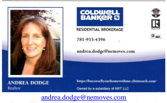
https://buyorsellyourhomewithme.cbintouch.com/ A Gerry 5 Sponsor Spot

"F-E-A-R has two meanings: Forget Everything and Run or Face Everything and Rise. The choice is yours." \sim Zig Ziglar