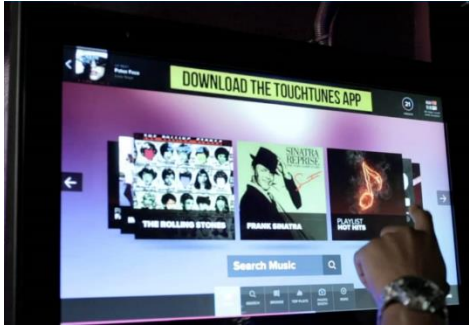
TOUCHTUNES Internet Jukebox

The Gerry 5 VFA newsletter is published monthly in both hardcopy and electronic formats. Deadline for submission of information is Thursday following the member meeting.