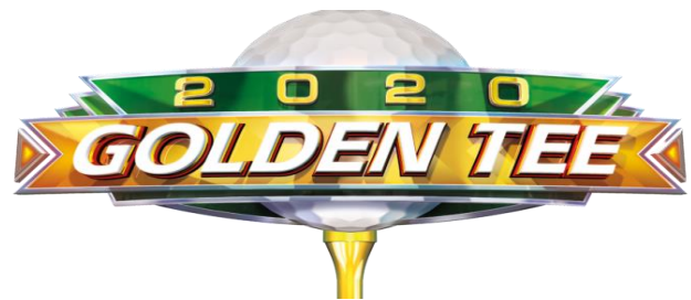
Golden Tee 2020 is here