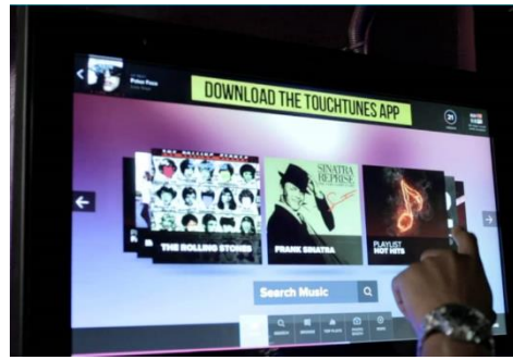
TOUCHTUNES Internet Jukebox

The Gerry 5 VFA newsletter is published monthly in both hardcopy and electronic formats. Deadline for submission of information is Thursday following the member meeting.