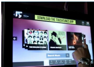
TOUCHTUNES Internet Jukebox

The Gerry 5 VFA newsletter is published monthly in both hardcopy and electronic formats. Deadline for submission of information is the first Wednesday of the month