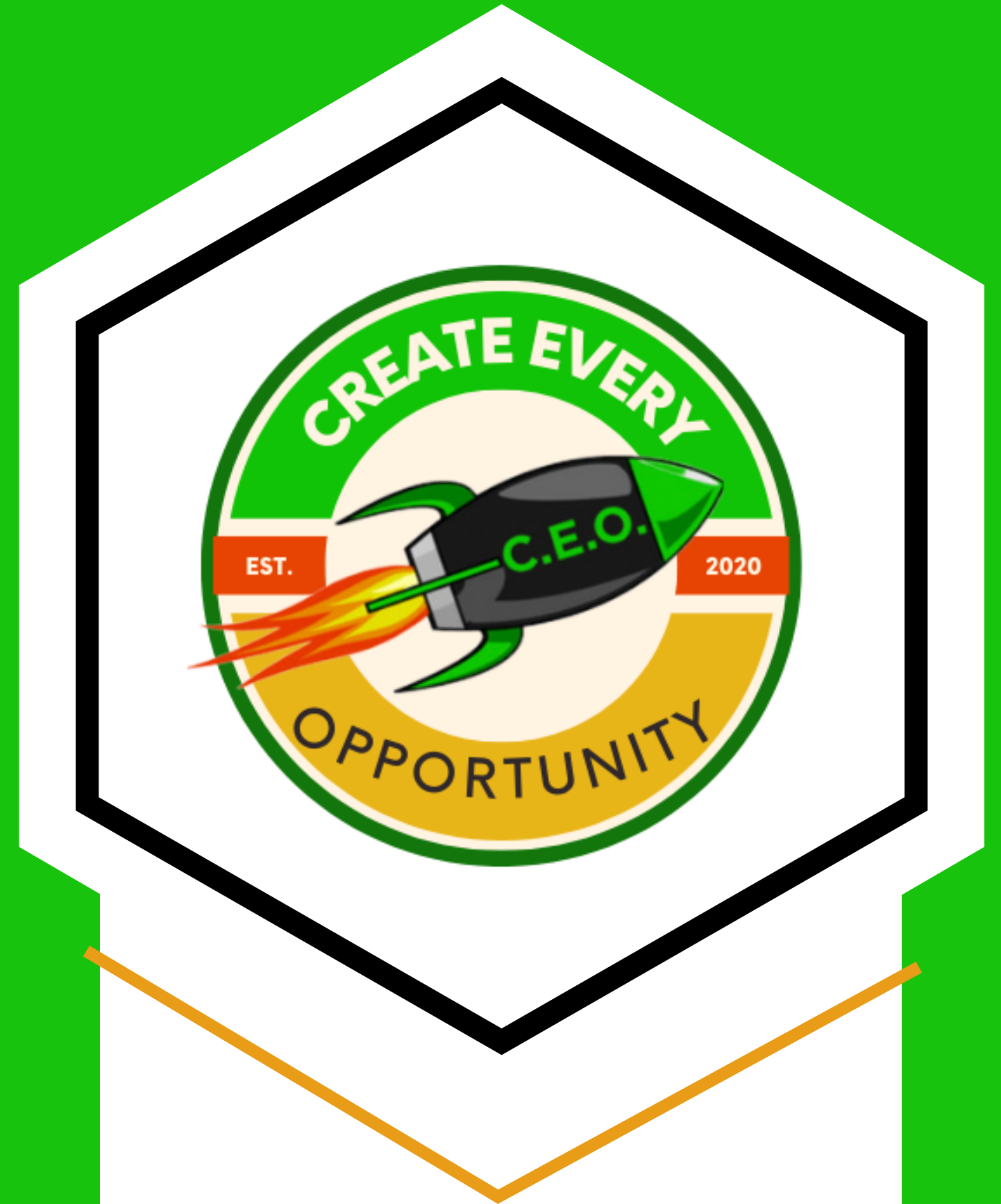
World Class, Online Learning Experience