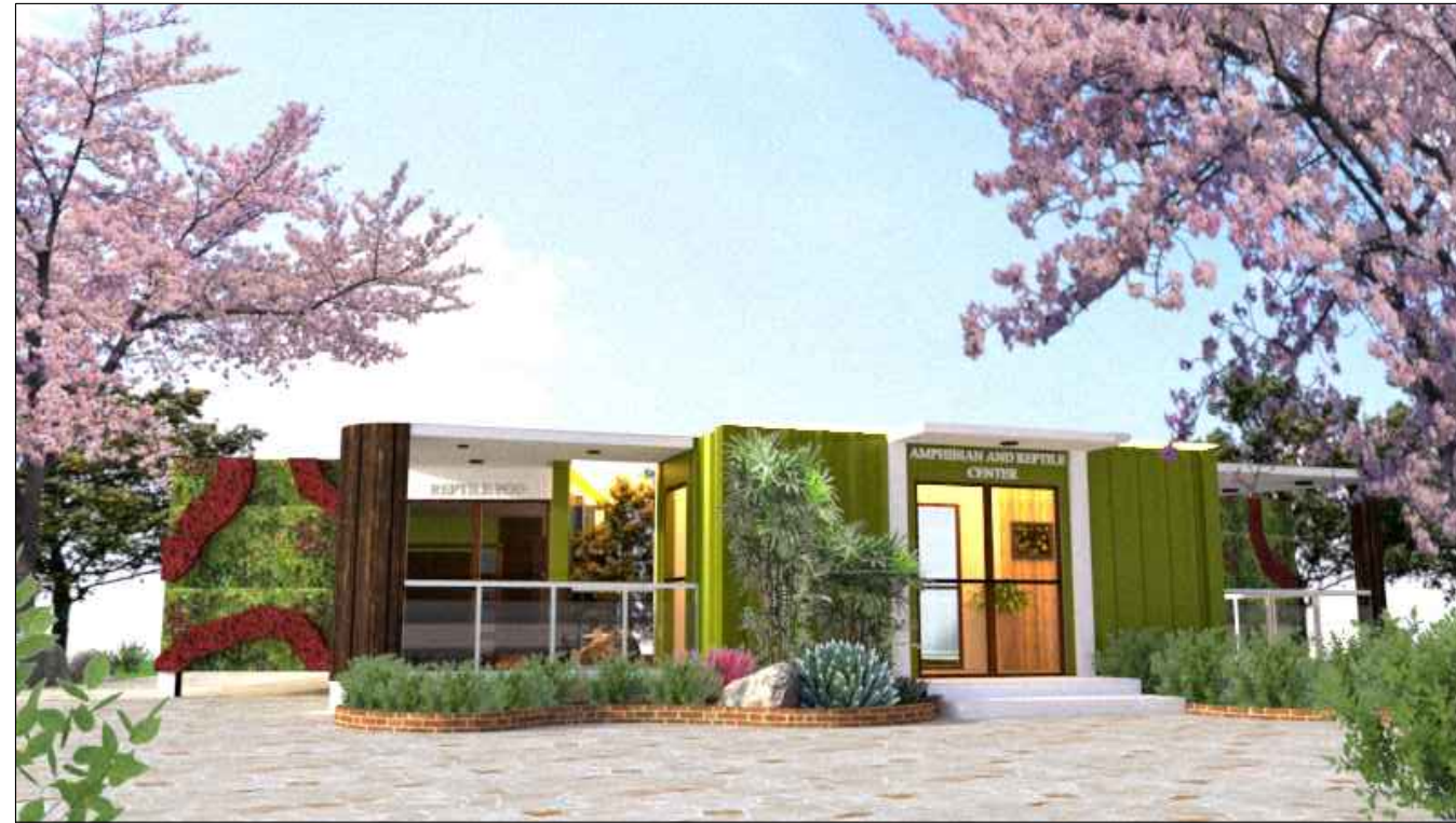
EXTERIOR PERSPECTIVE PLAN