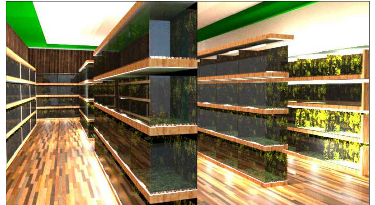
AMPHIBIAN POD INTERIOR PERSPECTIVE PLAN