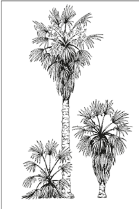
wudiji River Cabbage Palm

The Culture & Heritage Committee are considering how this book may be used in the future.