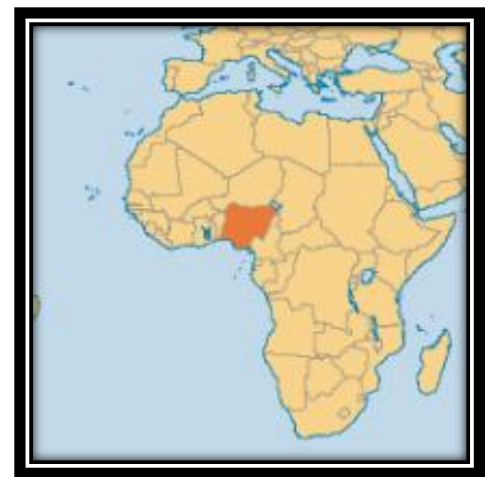
Nigeria in Africa