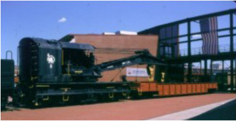
This Wrecking Crane and Boom Car from the Central Railroad of New Jersey (CNJ) are parked near the ticket office.