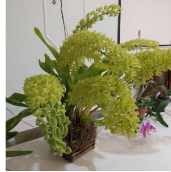
Show & Tell Flowers from the July Meeting