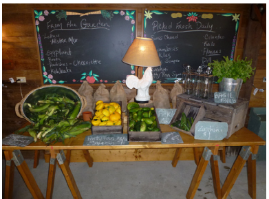
Various Produce grown and sold in the Elawa Farm Market