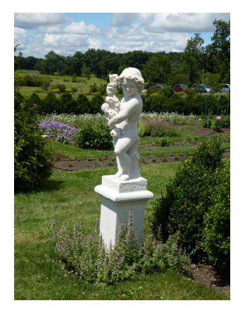
This summer, farm statuary return to their original places in the Garden.

A Great Thanks to the Deer Path Garden Club for their generosity towards our blueberry patch this past year.