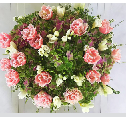
FLORAL ARRANGING with Katie Ford

Katie is a local floral designer serving the Chicagoland area. She loves spreading joy through creating beautiful floral arrangments