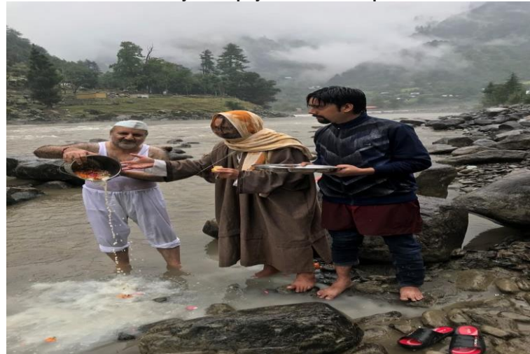
Sharda Puja at Kishenganga LOC Keran {just across river is POK}