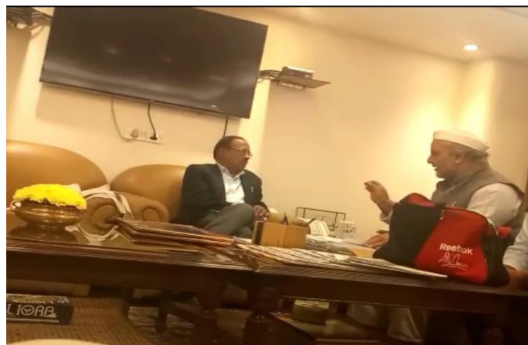
Meeting with NSA Sh. Ajit Doval on Sharda issue