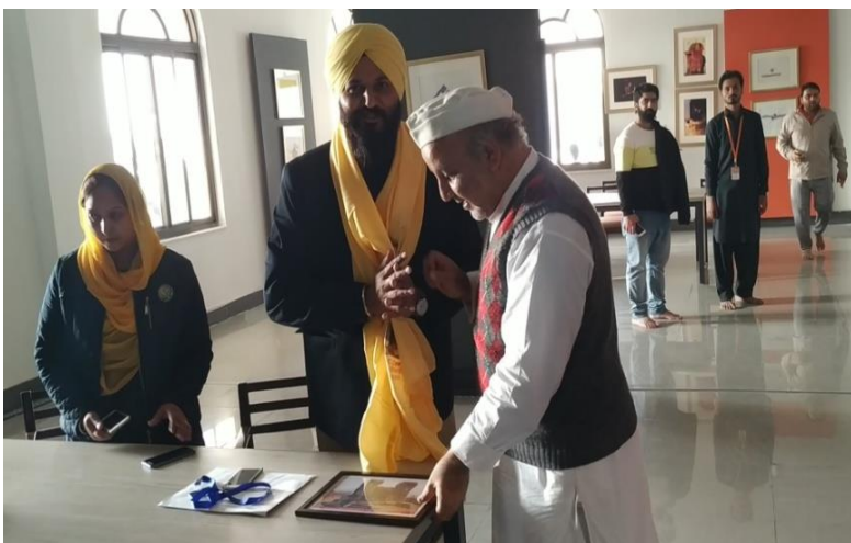
Meeting at Kartarpur Gurudwara, Pakistan