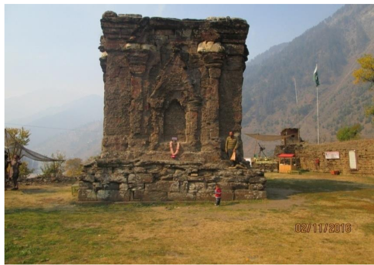
Laying of flowers by Civil society of POK in 2016