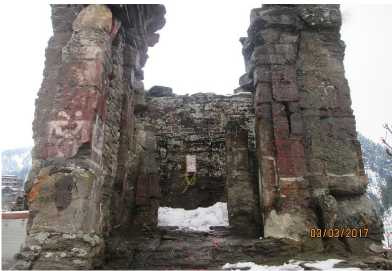
Installation of Sharda Photo at Sharda Peeth