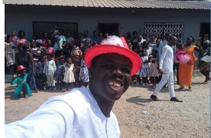
We have had great times at Church. December 31 st watch night service was great, and the last Sunday of the year was super. Praise God! Hope Bible club has ran well. The children are getting more and more excited to learn. Praying for leaders and funds to print more hand books. And I will need to make some time to another level of the handbooks before they catch up with me. Space continues to be our greatest challenge.