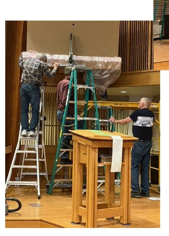
100 lbs TV's going up