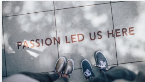
Mission of the Month