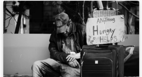
Daybreak Homeless Shelter