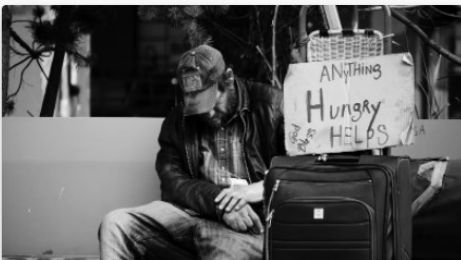
Daybreak Homeless Shelter