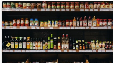
Ridgewood Food Pantry

If you prefer to use the purchasing power through the Northern Illinois Food Bank, you may make a monetary donation. Our day at the Food Pantry is the third Wednesday of the Month.