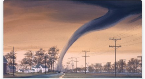
UMCOR Disaster Relief