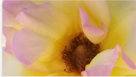
Flowers for the Altar

You can now submit payments/donations to all your favorite church causes right from our website! Go to www.graceumcjoliet.org and scroll down to the Vanco section. Click the button to open a variety of church cause to select from. Donate to the Mission of the Month or Ridgewood Food Pantry, pay for Flowers for the Altar, use Amazon Smile and designate Grace Joliet as your beneficiary.