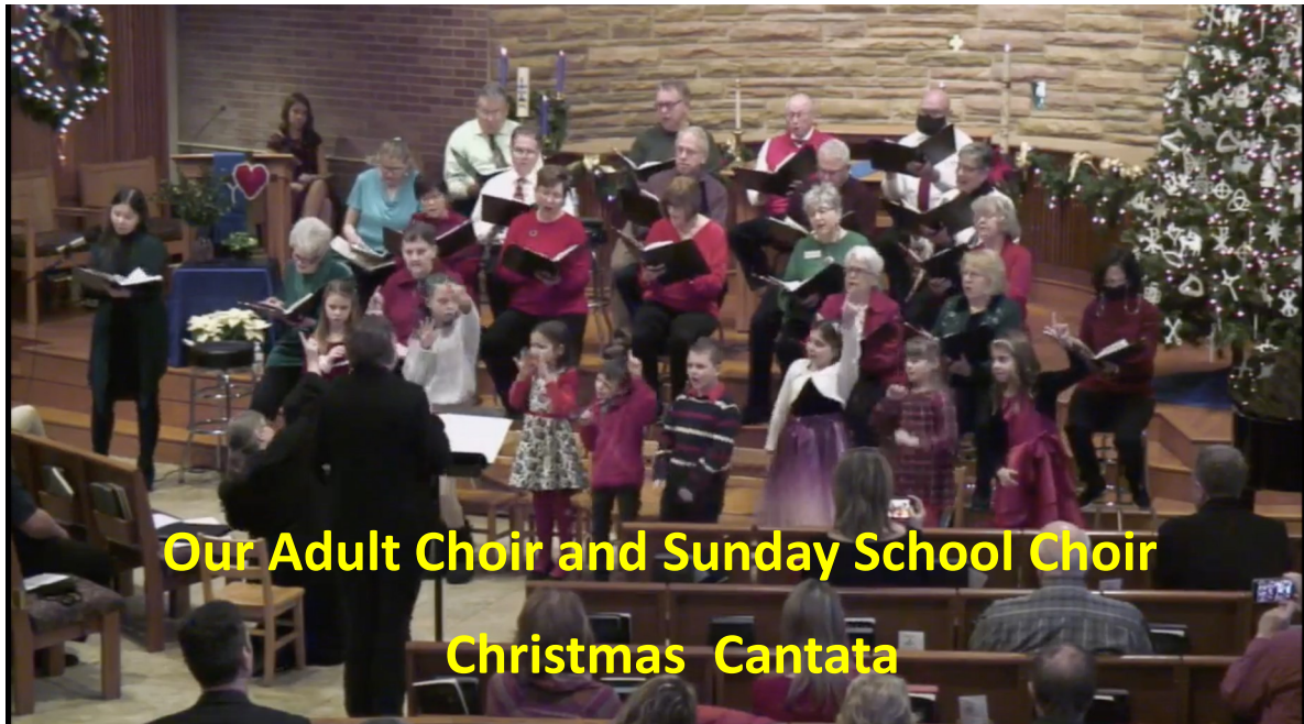
Our Adult Choir and Sunday School Choir Christmas Cantata

This mixed farming project was set up to reduce food shortages through improved crop reduction processes and providing viable seed lands for production on an out-grower basis as well as production of animals for supply to peasant farmers.