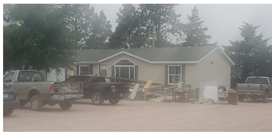
Tree of Life office