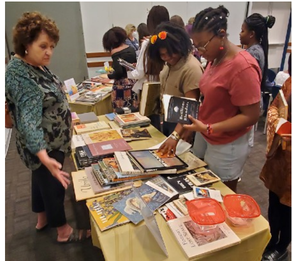
Our book and art supplies give away tables last year were a big hit last year with the students!