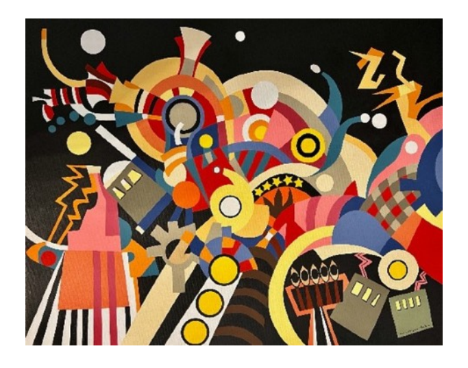
Night Dance is part of Masur Museum of Art's 62nd Annual Juried Competition, Monroe, LA February 20 – May 3, 2025.

Piano Rotation, an acrylic painting, received an Honorable Mention in the Martin Arts Annual All Florida Exhibition and will be on exhibit at the Cultural Council of Palm Beach County, Biennial, Lake Worth, April 11 – June 20, 2025.