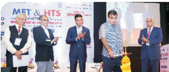
Inauguration of MET & HTS 2018 Lighting of Lamp by Mr. Nitin Gadkari, Hon'ble Minister for Road Transport & Shipping, Government of India