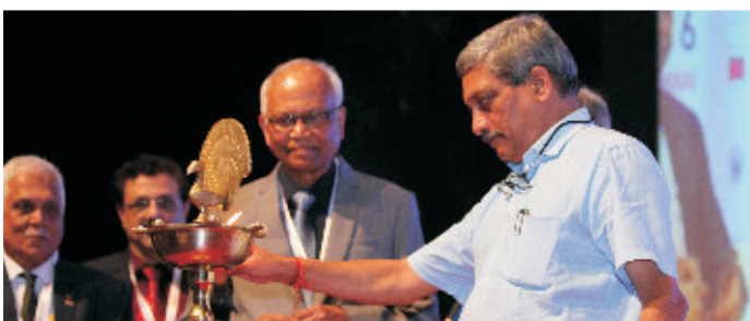
Inauguration of MET & HTS 2016 Lighting of Lamp by Late Mr. Manohar Parikar, Defence Minister, Government of India