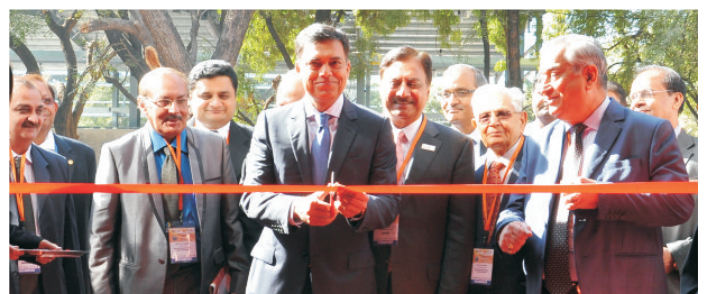
Inauguration of MET & HTS 2014 Event Ribbon Cutting by Mr. Sajjan Jindal, CMD, JSW Group