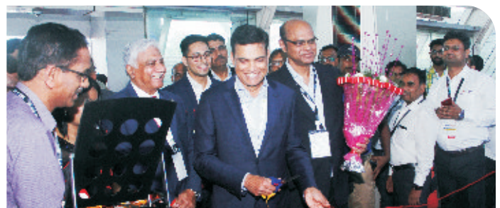
Inauguration of MET & HTS 2018 Exhibition Ribbon Cutting by Mr. Sajjan Jindal, CMD, JSW Group