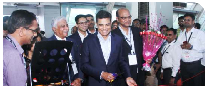
Inauguration of MET & HTS 2018 Exhibition Ribbon Cutting by Mr. Sajjan Jindal, CMD, JSW Group