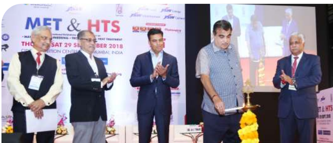
Inauguration of MET & HTS 2018 Lighting of Lamp by Mr. Nitin Gadkari, Hon'ble Minister for Road Transport & Shipping, Government of India