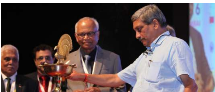
Inauguration of MET & HTS 2016 Lighting of Lamp by Late Mr. Manohar Parikar, Defence Minister, Government of India