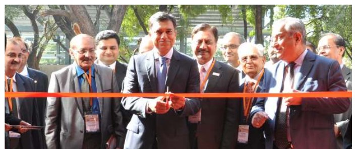
Inauguration of MET & HTS 2014 Event Ribbon Cutting by Mr. Sajjan Jindal, CMD, JSW Group