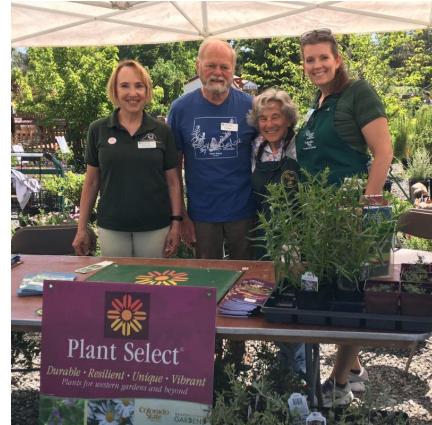
Photo: Colorado Master Gardeners at Echter's Nursery and Garden Center

Master gardeners: Check your VMS soon to sign up for volunteer spots.