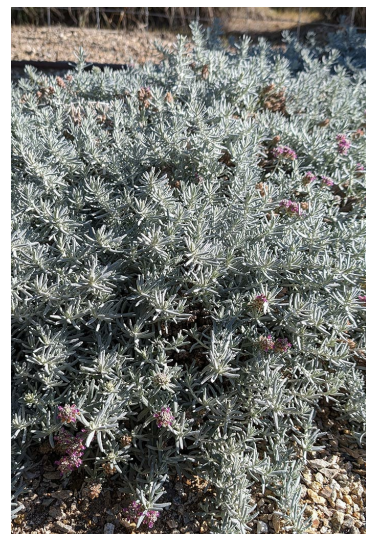
EVERSILVER™ creeping germander