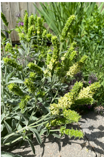
SARADA'S™ Greek mountain tea