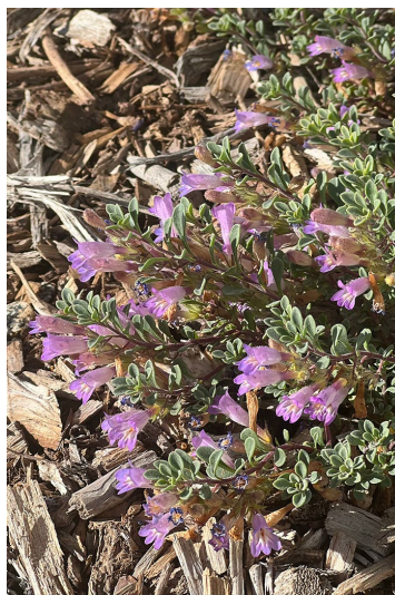
Tushar bluemat penstemon (Utah)