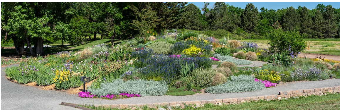
Plant Select Demonstration Garden in the late spring Denver Botanic Gardens Chatfield Farms

If you're new to our newsletter, cheers! For 27 years, our non-profit has tested and selected plants that thrive in the high plains and intermountain regions, so you can create waterwise landscapes that are beautiful, low maintenance and have a positive environmental impact—no matter what your skill level.