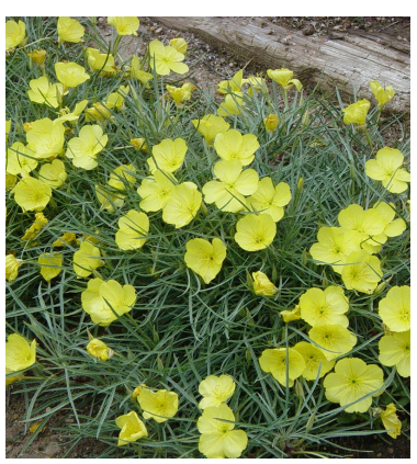
Shimmer evening primrose Oenothera fremontii 'Shimmer' PP1 9,663