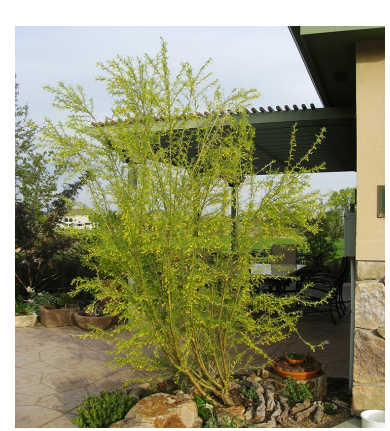
TIDY littleleaf peashrub Caragana microphylla 'Tidy'