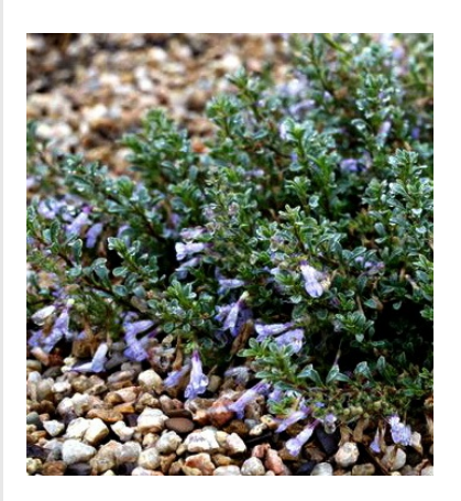
TUSHAR bluemat penstemon Penstemon xylus

Explore our 2023 plants through these one-minute videos