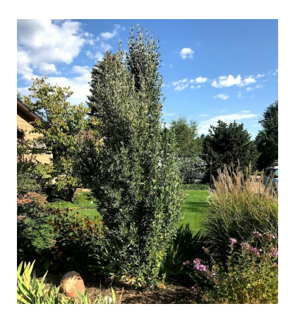
SILVER TOTEM® buffaloberry Shepherdia argentea 'Totem'