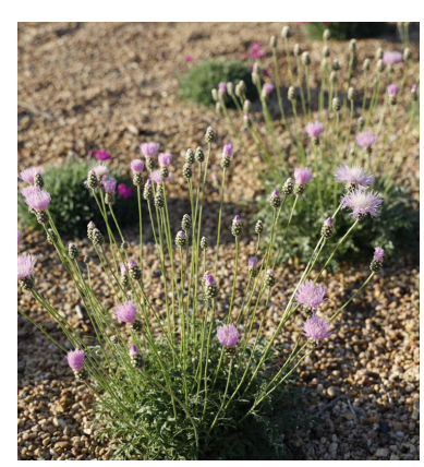
Bellina pink cornflower Psephellus simplicicaulis