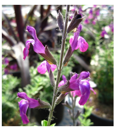
Ultra Violet Salvia Salvia 'Ultra Violet' PP 21, 411