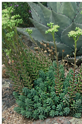
Turquoise Tails Sedum