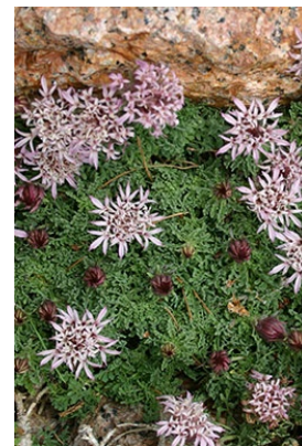
Moroccan Pincushion Flower