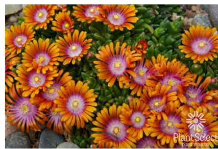
FIRE SPINNER® ice plant ( Delosperma 'P001S')

% Colorado State University 1173 Campus Delivery Fort Collins, CO 80523-1173 PH: (970)-481-3429