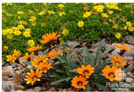
TANAGER® gazania ( Gazania krebsiana )