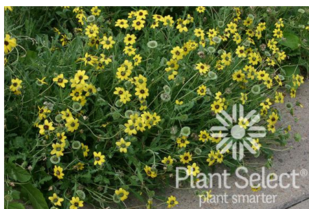
Chocolate flower ( Berlandiera lyrata )