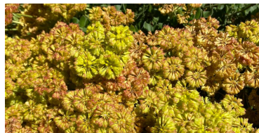
KANNAH CREEK® Buckwheat Eriogonum umbellatum var. aureum 'Psdowns'