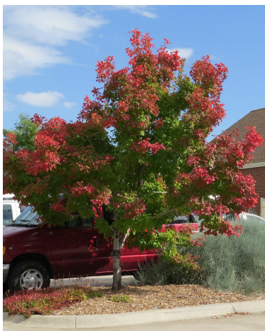
HOT WINGS® Tatarian Maple