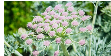
Moon Carrot Seseli gummiferum