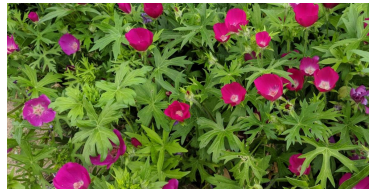
Winecups Callirhoe involucrata