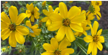
Englemann's Daisy Engelmannia peristenia