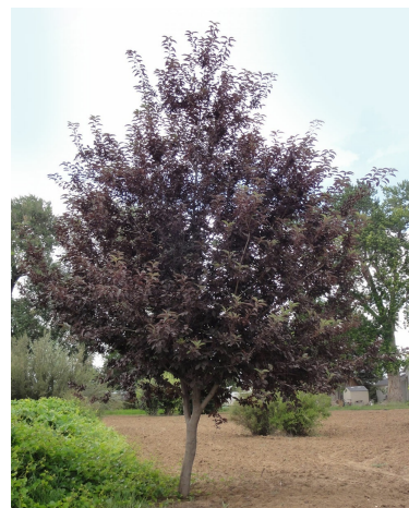
SUCKER PUNCH® Chokecherry